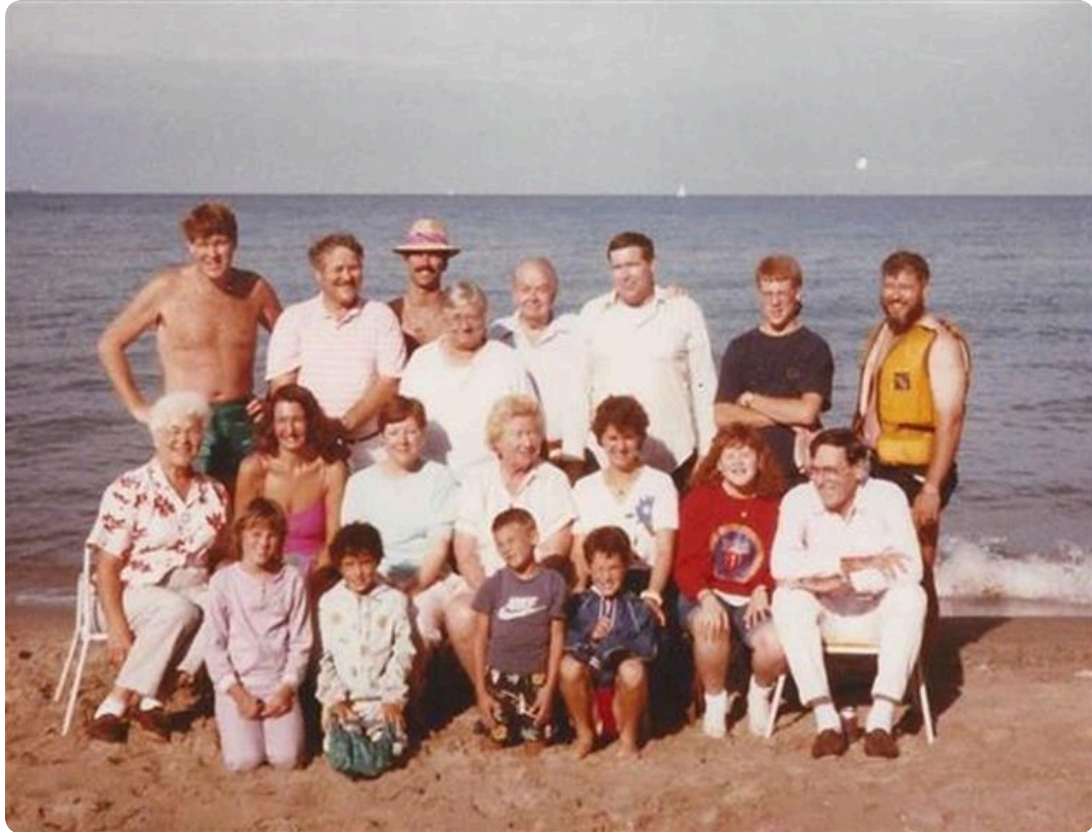
At "Uncle Bill's"